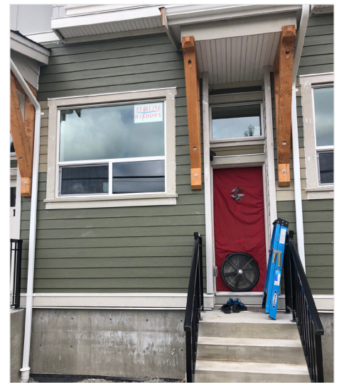
Image 2: Final blower door testing at multi-family townhouse project.

More information about the BC Energy Step Code is available at energystepcode.ca