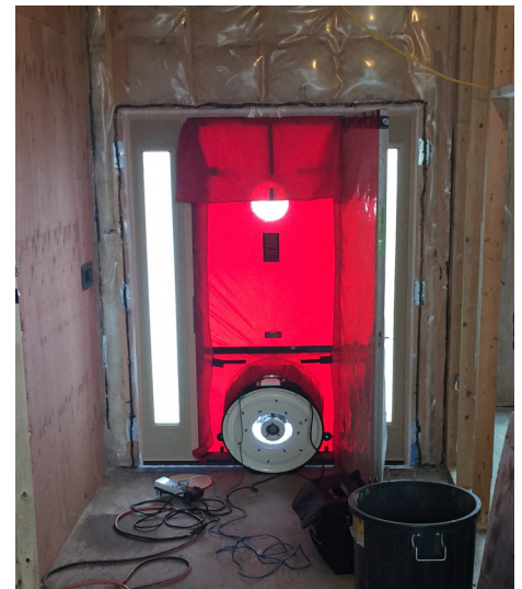
Image 3: An air tightness (“blower door”) test during Mid-Construction Stage

Some Part 9 multi-unit residential buildings require a unique approach to energy modelling using the EnerGuide Rating System. An Instruction Manual and Microsoft Excel BC Energy Step Code Compliance Calculator workbook with integrated BC Energy Compliance Report Generators is now available to assist EnerGuide Rating System Energy Advisors. It can be accessed at bit.ly/bc-sc-compliance-manual and includes guidance for modelling townhouse and other Part 9 multi-unit residential buildings, as well as guidance and tools for filling out Step Code compliance forms for these building types.