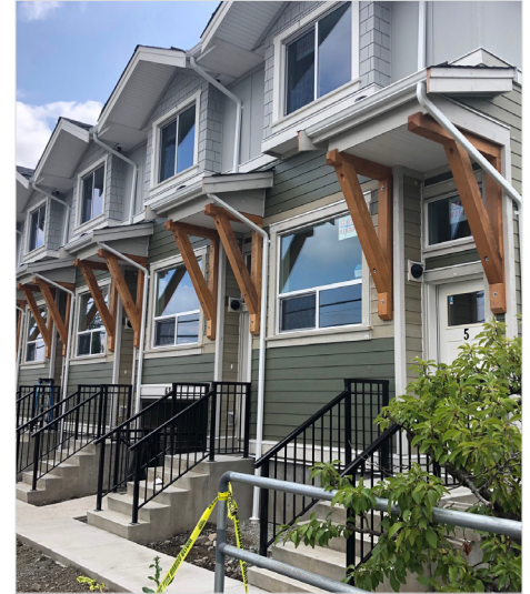
Image 1: A multi-family townhouse project designed and constructed to meet Energy Step Code 3 requirements.